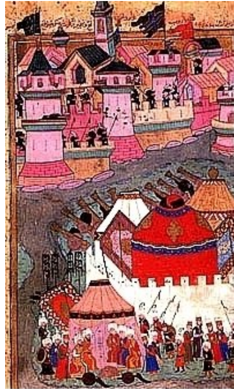
Siege of Vienna (1529). From a Turkish manuscript, Huner-nama (Book of Skills). Istanbul, 1588.

Currently about two-thirds of the German population, more than 55 million people, officially belong to a Christian Church, although many of them take no part in church life. Almost half of them are Protestants, while the other near half are Catholics. Approximately three million followers of Islam and 100,000 Jews live in Germany today.