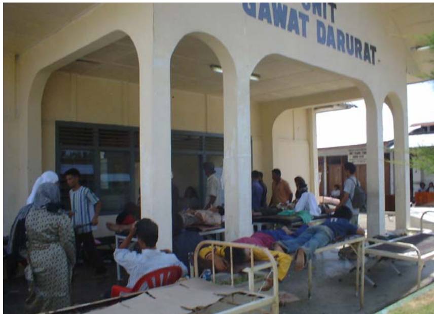
Unit Gawat Darurat (UGD) di sebuah rumah sakit

There is also a private emergency service called International SOS which has offices in Jakarta and Bali. International SOS provides aircraft and emergency ambulances for taking patients to the hospital 24 hours a day. This service costs a lot of money and not many people are able to afford it. This company also provides evacuation for taking patients to hospitals in other countries such as Singapore or Malaysia. These have better treatment for patients